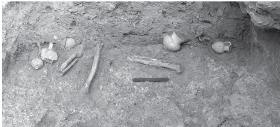
Figure 2. An overview of the Middle Bronze Age II B burials (Burial 1 to the right, Burial 2 to the left).

MB burials were unearthed. There were however two additional burials uncovered, in different areas of the tel, identified as Bedouin.