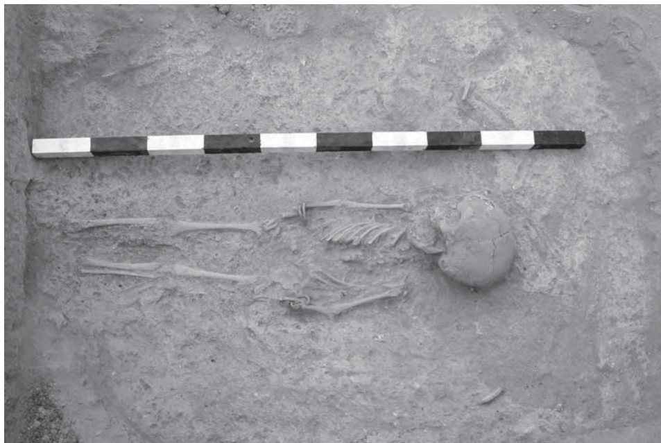
Figure 3. Bedouin burial from the square SW.K.7

Bone inventory: The bones present included the fragmented, but entire skull, lacking only few pieces of the mandible body and some parts of the vault and right scapula. Also deciduous teeth from both maxillae and mandible were present as well as some germs of the permanent premolar and molar teeth.