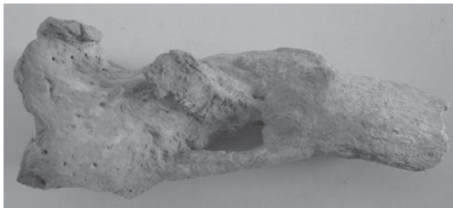
Figure 2. Healed osteomyelitis in the distal end of the left radius, STS2XVIIF24 (mature male [?]).

of stress markers were observed, although there are some possible differences between the western and eastern parts of the tell. In the west (Goldar Tepe, Areas ST, and TTM), the frequency of porotic hyperostosis seems to be slightly lower and the frequency of dental caries higher compared to the east (Areas AH, AI, and AL). However, such levels of superficial differences may also be observed between Areas AH and AI in the eastern part of the site and it remains impossible to verify them based on such a small sample size.