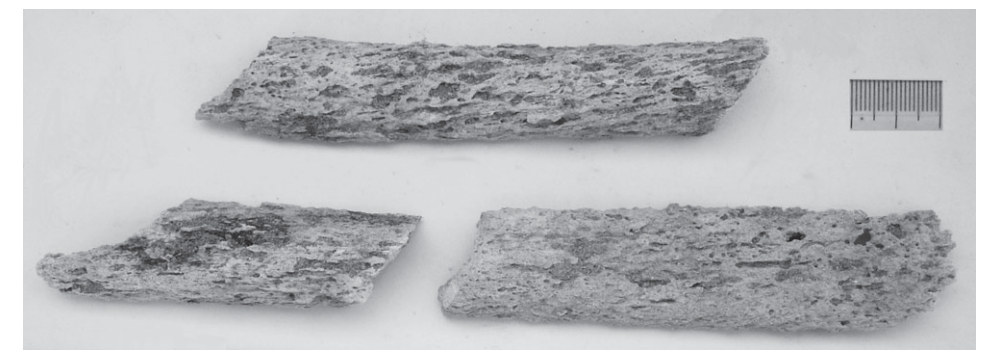
Figure 1. Example of water erosion in bones from As-Sabiyah (SRF).

Preservation of the skeletons was generally poor in all areas; only four burials contained what might be considered as nearly complete skeletons. Although a desert environment, water was the chief factor in post-depositional damage to the burials at the sites. Nearly all of the individuals buried in the As-Sabiyah area were placed directly on bedrock, covered by stones and only a thin layer of sand. Unfortunately for the burials, water frequently flowed over this bedrock, dissolving bone as it went. Moreover, trabecular bone withholds more moisture com-