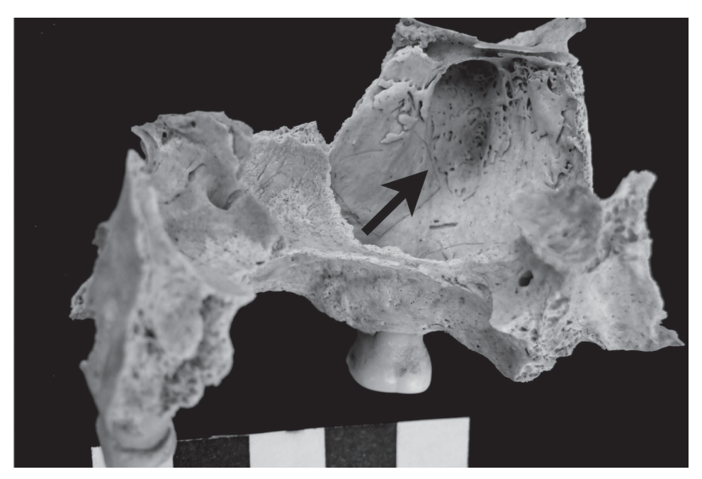
Figure 2. New bone formation as a sign of sinusitis in the right maxillary sinus of Nr. 14.

The most interesting finding is the remarkably high frequency of maxillary sinusitis. In 14 individuals, where maxillary sinuses were present for examination, 4 cases of sinusitis were observed (see Figure 2 ). The cold, humid, and windy weather during Phokaia winters might be responsible for this condition.