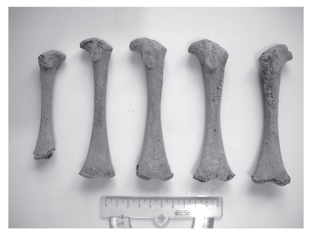
Figure 2. Femora of selected subadult individuals from Area AG IV, from left to right #6–8 (dental age 0.5+), #20-28 (dental age 1.0), #7-62 (dental age 1.25), #101-321 (dental age 0.75), #32-154 (dental age 1.0).