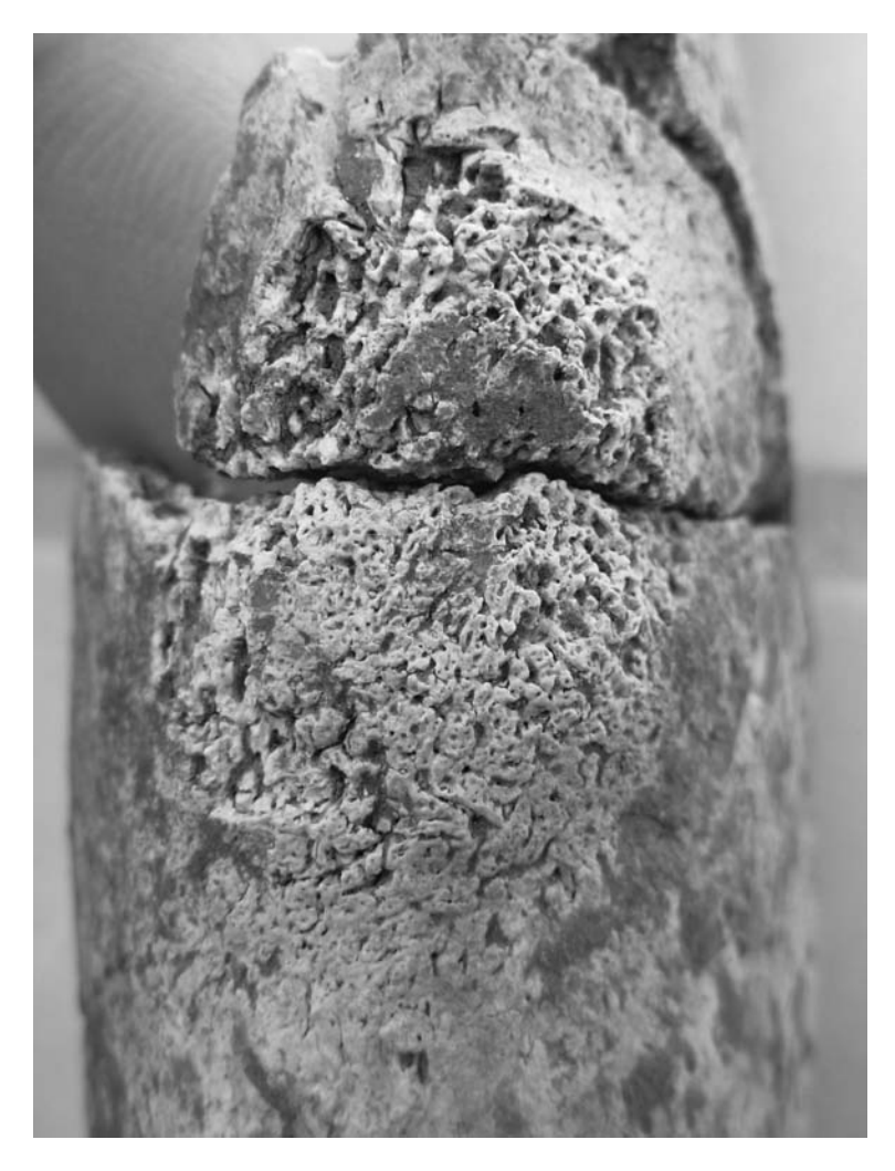
Figure 7. Active periosteal reaction (21 \times 16 \text{mm}) on the lateral side of the right tibia, distal to the midshaft; on the same bone there are two thickened areas on the posterior and the anterior surface with no foci of active reaction, 40-50 years-old female from grave VI.

sides; among females, one was found with the forearms folded across the abdomen. Subadult burials seem to follow the adults orientation; two subadult skeletons for whom position is discernable, are found extended with a NW-SE orientation (the same orientation is recorded for males). There is little material evidence indicating the preparation of the dead body for burial: offerings, accompanying objects and few personal jewelry including small clay vessels, coins, a necklace (grave \gamma ), and clothes accessories such as a bronze foil (grave VI), a bracelet and a buckle (grave \sigma\tau ). In three