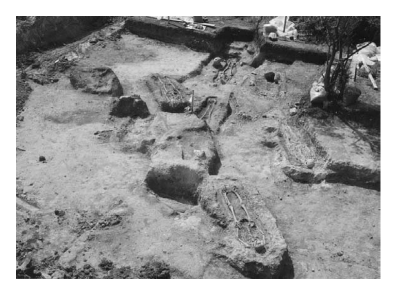
Figure 2. Burials from the Late Roman cemetery of Pigi Athinas.

During the Late Roman period a farming community occupied the site of Pigi Athinas. Archaeological findings from the farmhouse cover the period from the 1<sup>st</sup> to 4<sup>th</sup> century A.D., which implies several phases of occupation (Poulaki-Pantermali 2005). Architectural remains and artifacts suggest an economy based on agriculture (Poulaki 2003:56; Poulaki-Pantermali 2005:460). The burials presented here correspond to the latest phase of occupation of the farmhouse (ca. first half of the 4<sup>th</sup> century A.D.) ( Figure 2 ). The cemetery included 15 pit graves and a jar burial (N°VII). All the graves held primary burials while in four of them a second individual was identified. A total of 17 individuals have been studied, which came from 13 out of 16 burial structures excavated.