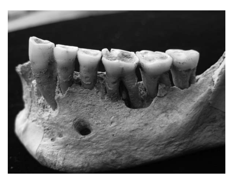
Figure 4. Vertical bone loss in the left first and second lower molars, 40-50 years-old male from grave \theta .

consumption of foods that predispose the individual to plaque formation (i.e. a diet rich in sugar, carbohydrates and plant tissues) (Hillson 1979, 1986:291; Larsen et al. 1991:179; Touger-Decker & van Loveren 2003:888, 890). On the other hand, it is interesting to note that a similar pattern of dental diseases, especially a high inci-