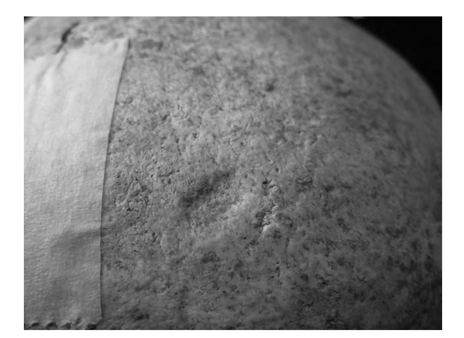
Figure 6. Possible healed fracture on the right frontal bone, 40-50 years-old male from grave \theta .