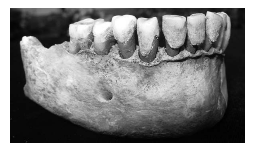
Figure 3. Horizontal bone loss and supragingival calculus in the right lower jaw, 50+ years-old female from grave \zeta .