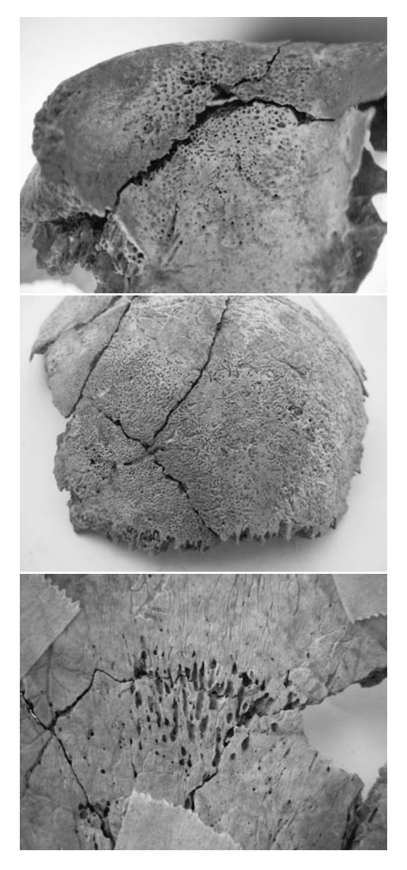
Figure 5. Right orbit exhibiting cribra orbitalia (top), left parietal exhibiting porotic hyperostosis (middle), osteolytic lesions on the internal surface of the left parietal (bottom) on the skull of the 7 year-old child from grave \beta .

occipitals (Table 4). The lesion is manifested mainly along the superficial vault surface, being slightly porotic in the form of a fine, regular pitting seen in small circumscribed