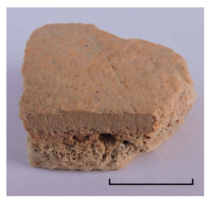
Figure 8. Cut mark, possibly perimortem trauma, element 1049. Scale bar 1cm.