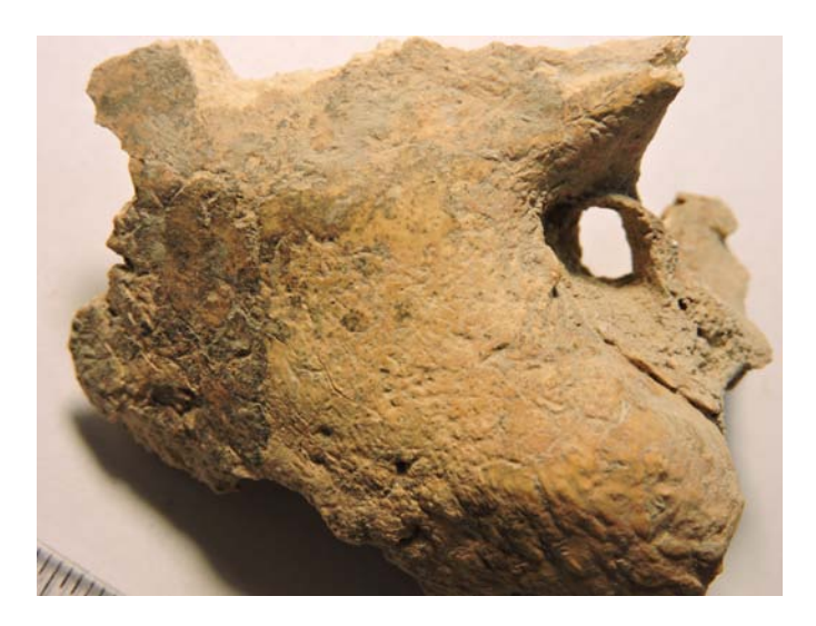
Figure 4. Pattern of sinuous etching, element 1027.