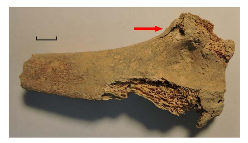
Figure 7. Puncture, element 1031. Scale bar 1cm.