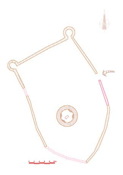
Figure 1. Tepe Qaleh Khalachan, plan of the site.

of smaller elements. This seems to be not the consequence of higher degradation risk for trabecular bone, as among preserved long bone fragments were both shafts and epiphyseal areas. Sex could be assessed in only three cases. There is a striking under-representation of subadults as only one cranial fragment per 56 elements was attributable to a child. Two fragments of alveoli with antemortem tooth loss (AMTL) may have belonged to aged individuals.