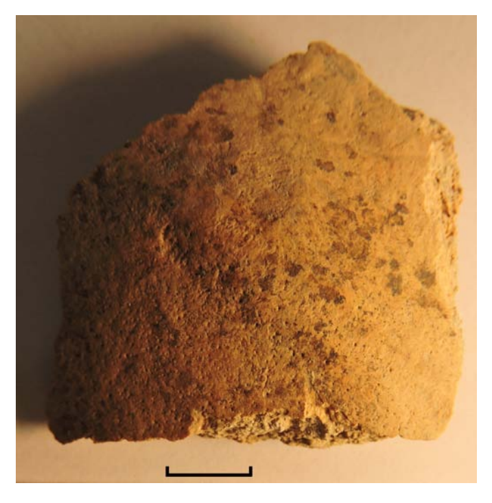
Figure 3. Black staining, element 1022. Scale bar 1cm