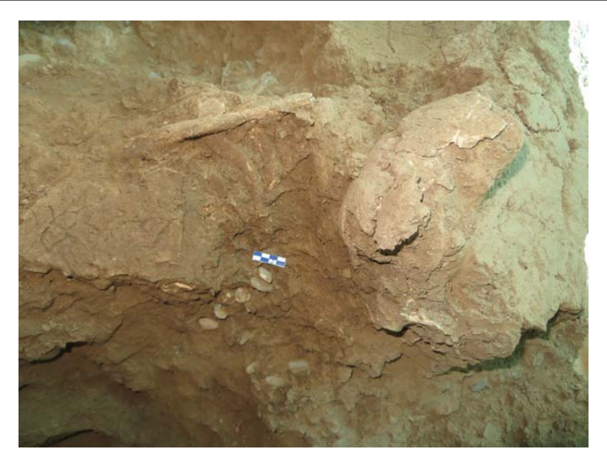
Figure 3. Human remains in trench XII, context no. 22.

squama with an intrasutural bone in the lambdoid suture, a slightly eroded femoral head without any signs of degenerative joint disease, and several long bone shaft fragments: two fragments of a femur, including the proximal metaphysis, two fragments of the left ulna, including the distal metaphysis, as well as fragments of a radius and left humerus.