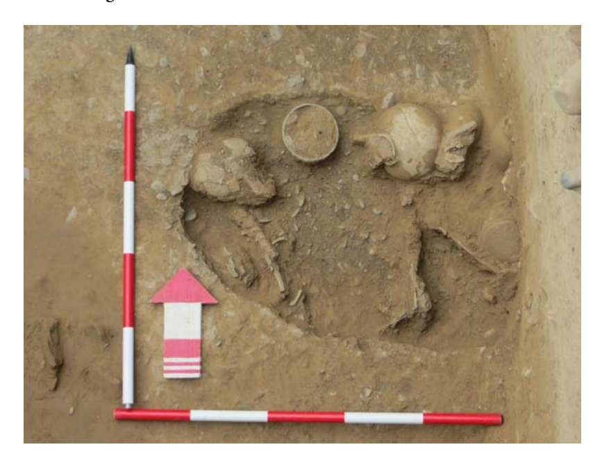
Figure 2. Trench X, context no. 12.