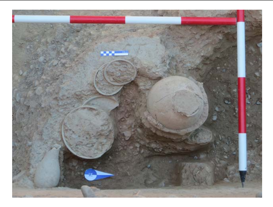
Figure 4. Artifacts from trench XII, context no. 22.