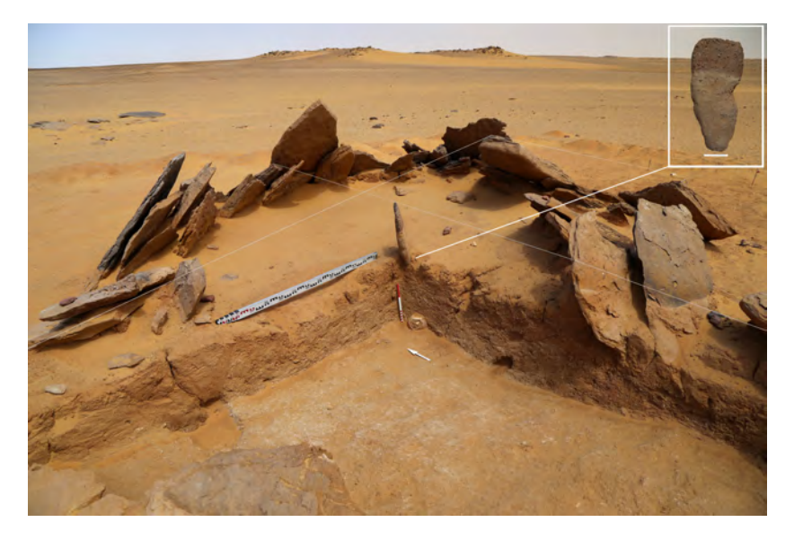
Figure 5. Bargat El-Shab, site E-12-04. The partially excavated Tumulus 1.