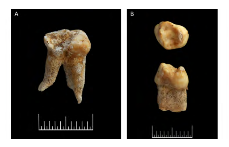
Figure 8. Bargat El-Shab. Interproximal wear visible on the right upper deciduous first molar from E-05-1/2 grave 1 (A), attrition observed on right lower deciduous first molar from E-12-04 Tumulus 1 (B).

100cm, although its original height could have been considerably larger (Figure 5). It had a stone enclave consisting of several dozen large quartzite sandstone slabs. Their oblique, inwardly oriented arrangement suggests that the embankment (which had suffered much deflation) was pounded first in order to cover it with stone. In the central part of the tumulus there is a burial pit which is oval in shape, with a diameter of about 0.7-1.0m and a depth of about 0.40-0.50m. A sub-adult individual was