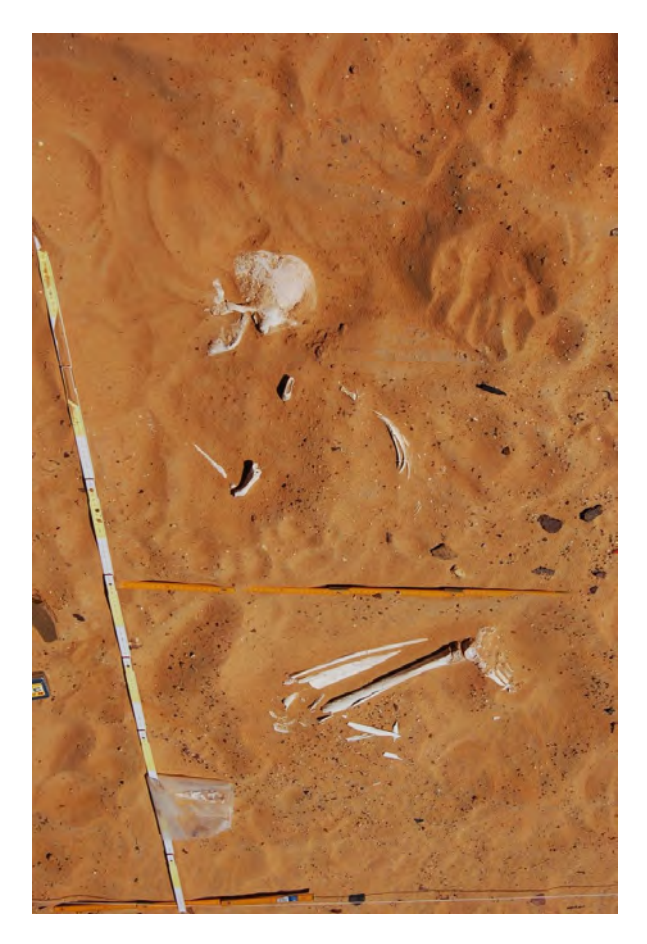
Figure 4. Bargat El-Shab, site E-05-1/3. The adult from context of grave 1.

2 \times 3 m) (Figure 4). No traces of a burial pit or any other features were observed during exploration, which is the result of the very severe deflation of the site at this location (see Bobrowski et al. 2020:196). Only the middle section of the axial skeleton was articulated. The upper and lower extremities were partially articulated or disarticulated. The sex of this individual was determined to be male based on the robusticity of the bones and preserved skull morphology, and age-at-death was estimated to be 35-50 years based on dental wear and suture closure. Preservation of the bone surface was poor, like in Grave 1, which made identification of pathological changes challenging. The vertebrae had osteophyte formation commonly associated with osteoarthritis as well as heavy attrition on the dentition. In addition, an apical abscess was observed on the mandible with root absorption on the lower left premolars.