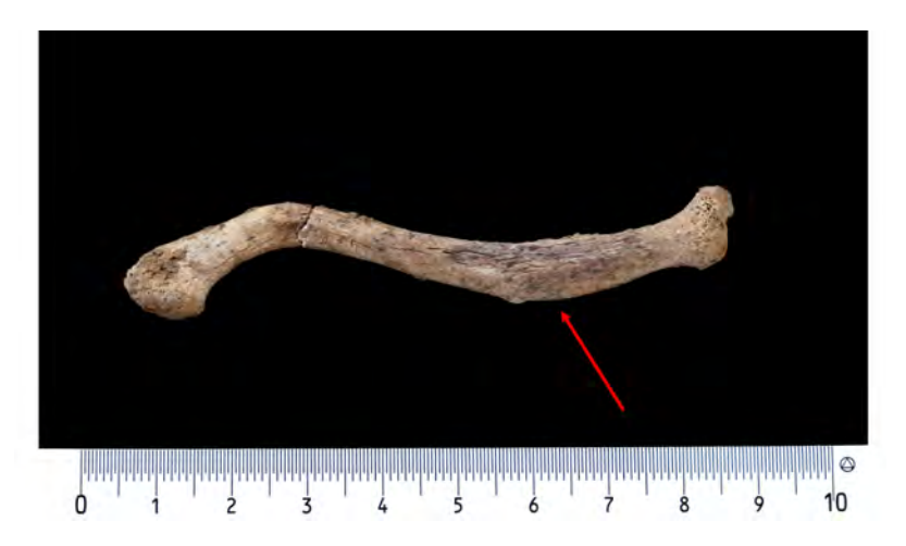
Figure 7. Bargat El-Shab, site E-12-04. Possible fracture from on right clavicle.