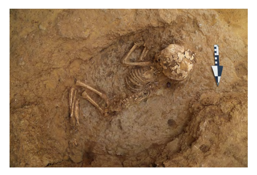
Figure 6. Bargat El-Shab, site E-12-04. The sub-adult individual from the Tumulus 1 context.

Tumulus 1 is located approximately 2km west of the settlement E-05-1. The tumulus is an oval structure with a diameter of about 4.5 meters and a height of roughly