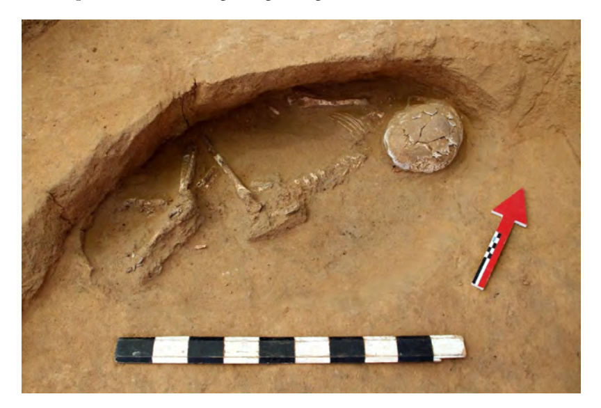
Figure 3. Bargat El-Shab, site E-05-1/2. Grave 1 in the course of the excavation of the settlement (A). The sub-adult individual from the Grave 1 context (B).

skeleton was discovered in tumulus 1 at site E-12-04 approximately 2km west of the settlement. While the human skeletal sample from Bargat El-Shab is small, the osteological assessment is important due to the limited number for skeletons excavated in this area and provides some insight regarding these individuals.