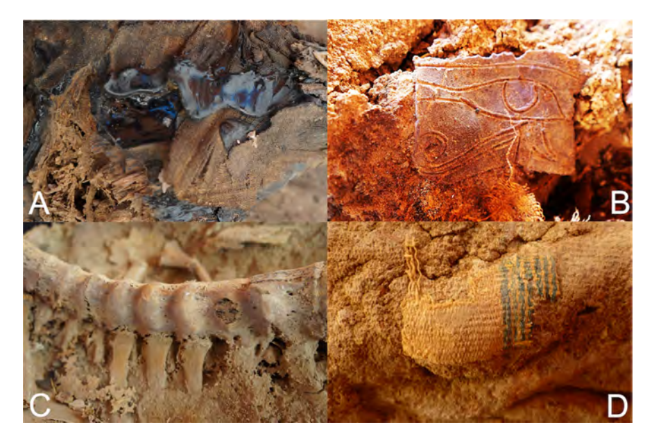
Figure 3. Materials identified from analyses of mummified and skeletonised human remains during the 2014 field season, A) honey-like, black resinous material utilised in the mummification process; B) right wadjet eye "plate for the flank" from Mummified Torso 10; C) evidence of DISH from Mummified Torso 10; D) example of textile with greenish dyed bands utilised for wrapping mummified individuals.

Evidence of the use of resinous material in the mummification process was ubiquitous among the individuals examined (Figure 3a). Appearing as a honey-like black substance, the composition of the identified resinous material could not be ascertained at the time of analyses and samples could not be obtained for chemical analyses (see Buckley & Evershed 2001).