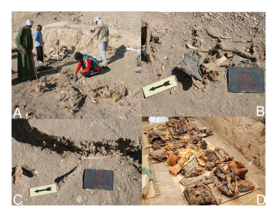
Figure 2. A) excavation of decontextualised remains; B) mummified remains from TT66/1 L. 5; C) mummified and skeletonised human remains from TT66/1,3 L. 5; D) mummified torsos and heads collected from before the façade of Saff -tomb 1 and stored in the chapel of TT65.

During the 2014 field season, a series of human remains, many with varying amounts of mummified soft tissue and wrappings (referred to in this report as 'mummified torsos' and 'mummified heads'), and some represented only by skeletal remains (referred to here as 'skeletonised remains'), were examined. These human remains were recovered from secondary contexts in proximity to the edge of TT66's forecourt and the façade of the previously mentioned Saff -tomb 1, having been recovered between 2010 and 2014 during removal of accumulated soil overburden and spoil bank deposits from previous excavations in the area (Figure 2) (Bács 2017). Given this information, and the context of recovery in the area of TT66 and the saff -tomb, the