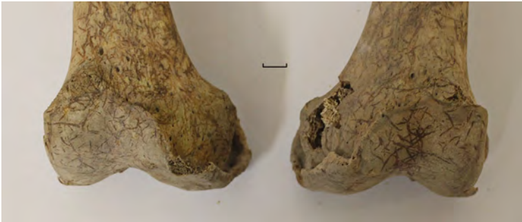
Figure 4. Degenerative joint disease in the knee joint of individual 11/2019. Scale bar 1cm.