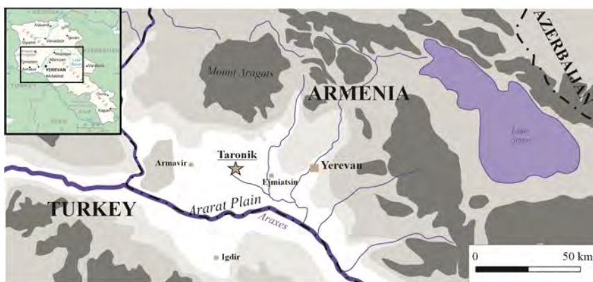
Figure 1. Map showing location of Metsamor. Drawing by M. Iskra.

The skeletons dated to that period were discovered buried in shallow graves. In these cases it was difficult to judge if they were intentionally dug out, or the dead