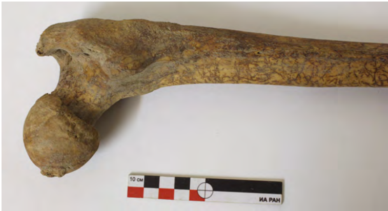
Figure 3. Degenerative joint disease in the femoral head of individual 10/2018.