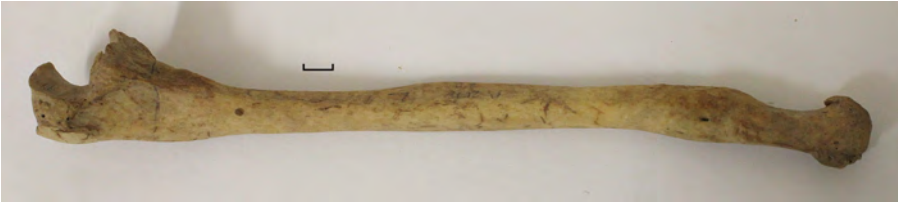
Figure 2. Fracture of left ulna in individual 10/2018. Scale bar 1cm.

high levels of activity beginning in childhood when the bones develop. Trauma was relatively rare at Metsamor, with only one small, healed depression fracture of a female skull (13/2021) and a completely healed fracture of the left ulna near its distal end in a male skeleton (10/2018), which was associated with deformation of the distal left radial metaphysis as well (Figure 2). The same individual suffered from advanced